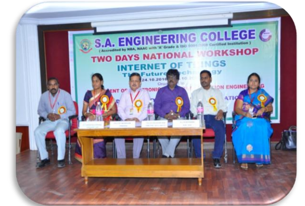
Two days National level workshop on “INTERNET OF THINGS-THE FUTURE TECHNOLOGY” sponsored by ISTE on 24.10.2016 &25.10.2016